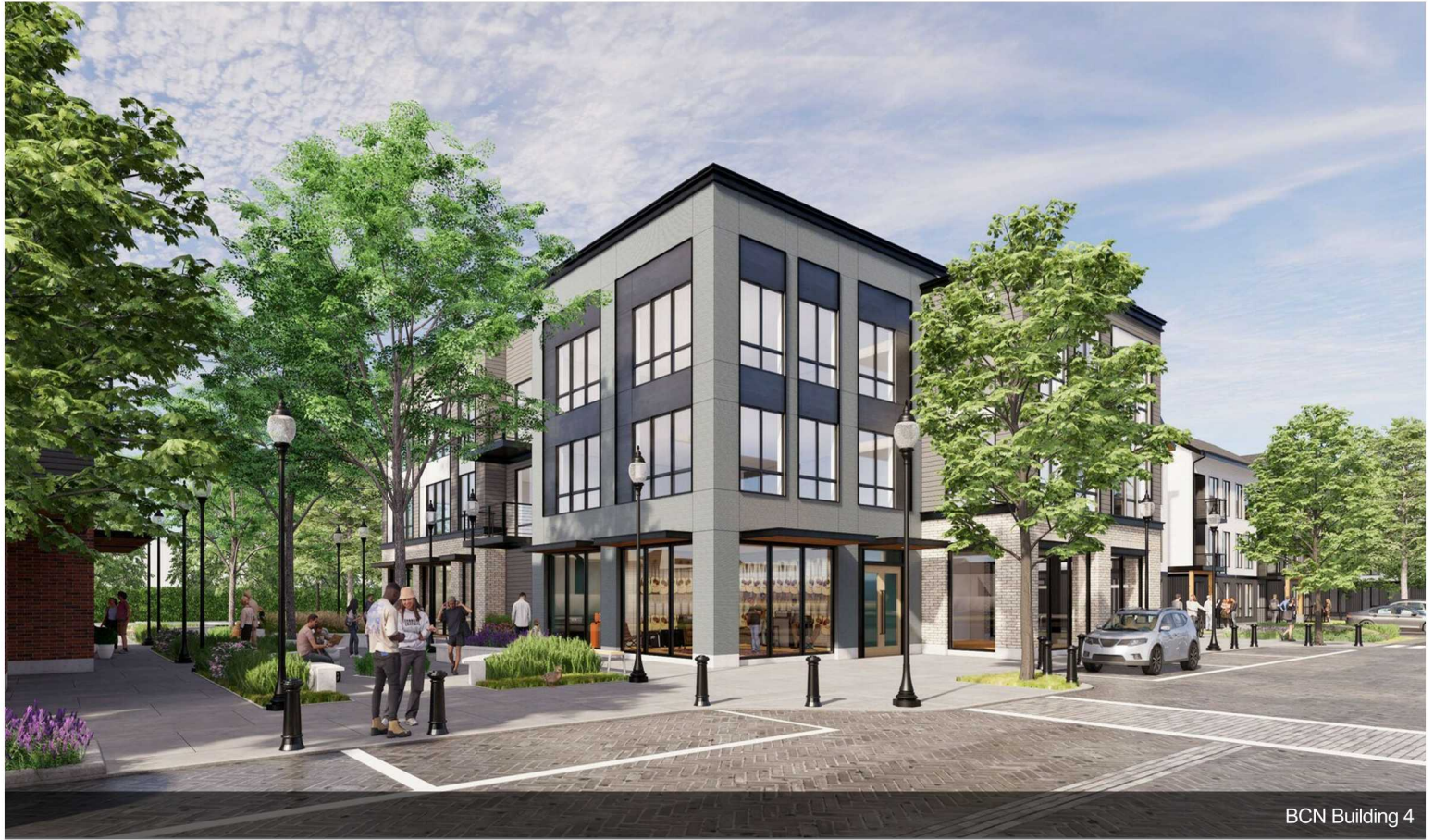
BCN Building 4