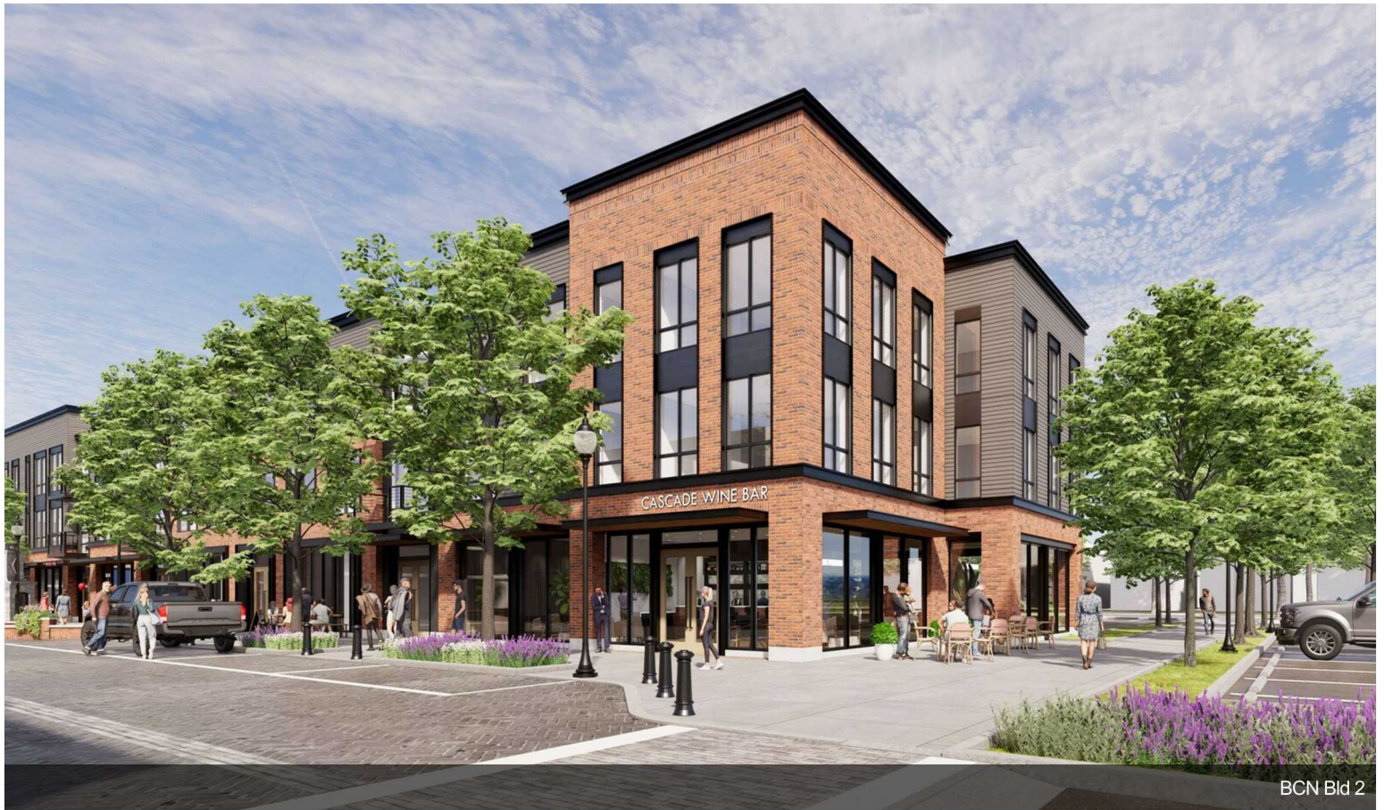
BCN Bld 2