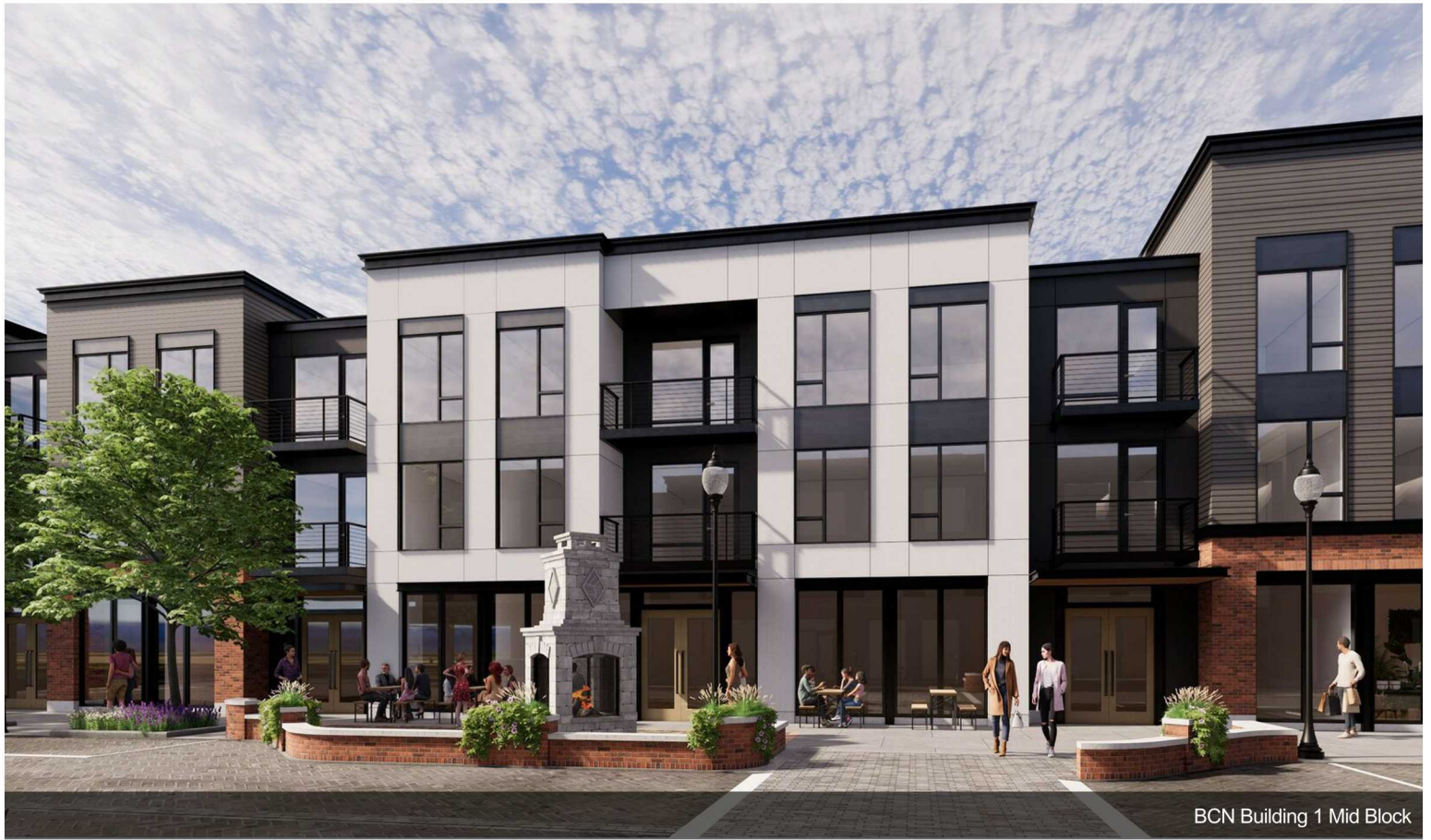
BCN Building 1 Mid Block