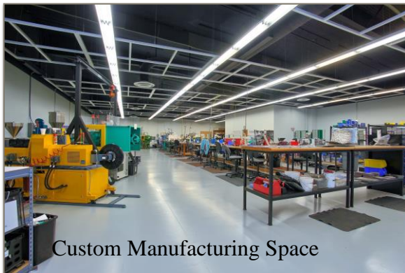
Custom Manufacturing Space