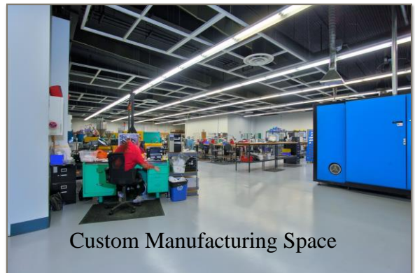
Custom Manufacturing Space