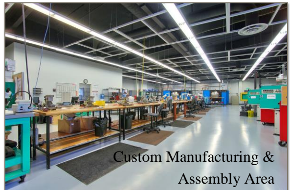
Custom Manufacturing & Assembly Area