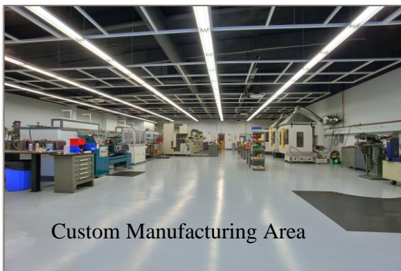
Custom Manufacturing Area