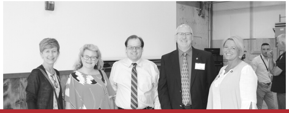
"MEDP has been such a great resource and support for our growing business and everyone there is so kind and responsive! "